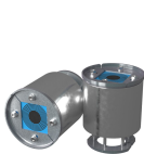
SLA R 100/1 AISI316