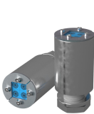
SLA R 50/4 AISI316