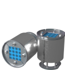
SLA R 100/16 GALV