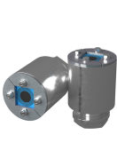
SLA R 75/1 AISI316