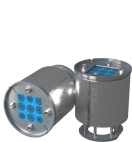
SLA R 100/9 AISI316