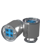
SLA R 100/4 AISI316