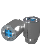
SLA R 75/4 AISI316